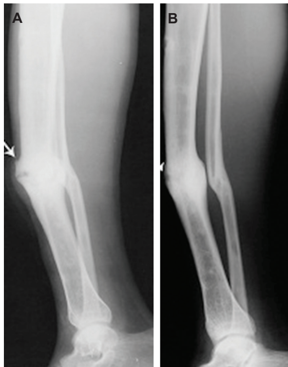
Fig.2: Lateral radiograph of a 32 years male non-united tibial fracture, arrow shows the fracture. A. Before intervention and B. 6 months after using MSCs in combination of platelet lysate product, arrow shows radiological signs of healing. MSCs; Mesenchymal stromal cells.