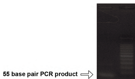
Fig 3: Electrophoresis of the PCR product.