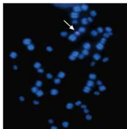
Fig 2: Single integration site of one of the transfected cell lines is mapped by FISH analysis.

Subsequently, the positive samples were subjected for FISH using whole gene construct as a probe. The result of fluorescence in situ hybridization also revealed that transgene integration in goat fetal fibroblasts, regardless of copy number, occurred within a single location in PCR positive cells (Fig 2).