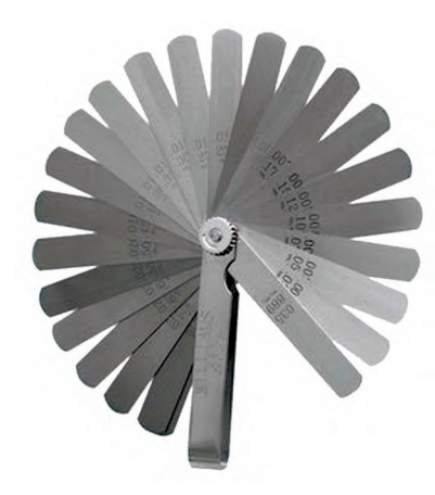
Fig 2: Leaf gauge.