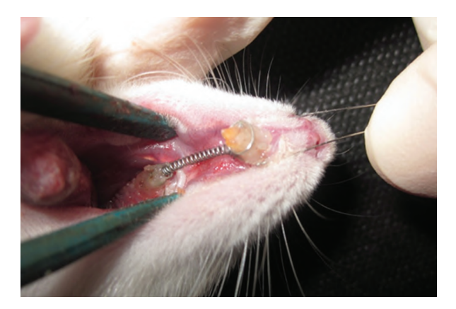
Fig 1: Placement of the orthodontic appliance.